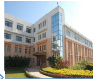
College of Agril. Biotechnology